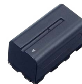
2x Li-Ion rechargeable battery 7.2 V 2.2 Ah