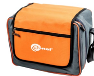
L-11 carrying case WAFUTL11