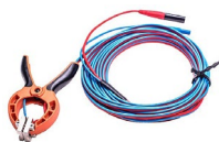
10 m double-wire test lead (Kelvin crocodile clip / banana plug) WAPRZ010DZBKEL