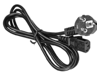
Mains cable - IEC C13 plug WAPRZ1X8BLIEC