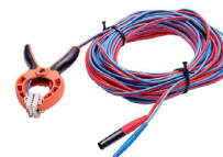
25 m double-wire test lead (Kelvin crocodile clip / banana plug) WAPRZ025DZBKEL