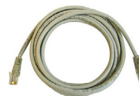
LAN cable (RJ45) WAPRZRJ45