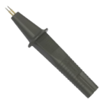
Double pin Kelvin probe (2 pcs.) WASONKEL20GB