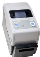
D2 portable USB report / barcode printer (Sato) WAADAD2