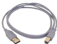
USB cable WAPRZUSB