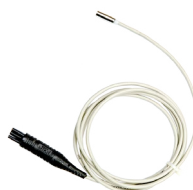
ST-1 temperature probe WASONT1