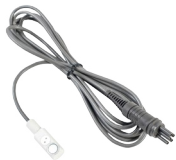
temperature probe ST-3 WASONT3